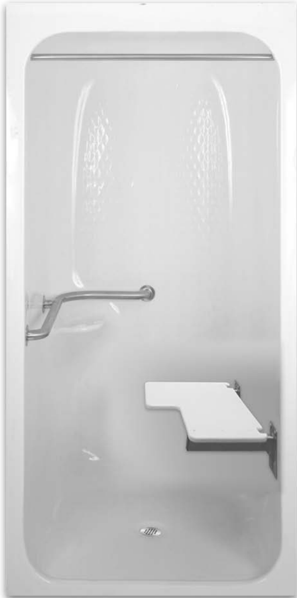
Shower shown with factory installed accessories Comes standard in white

41 1/4" x 36 1/4" x 82 7/8" 36" x 36" inside dimension