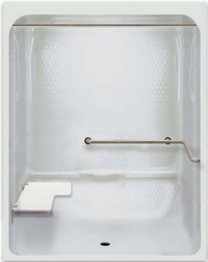
Shower shown with some available factory installed accessories Comes standard in white

64 1/2" x 36 1/4" x 82 3/4" 60" x 36" inside dimension